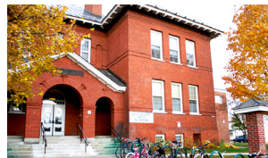
School-Based Dental Center